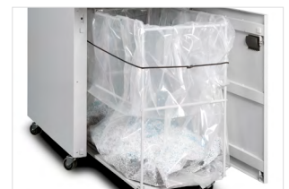
ADJUSTABLE REMOVABLE TROLLEY

It eliminates the need to manually lubricate the unit, ensuring maximum reliability, efficiency and capacity.