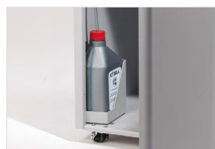
INTEGRATED AUTOMATIC OILING SYSTEM

Heavy duty chain drive with steel gears which offer reliability and resistance to wear.