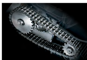
SUPER POTENTIAL POWER SYSTEM

Shows the shredding load required to optimize shredding without jams.