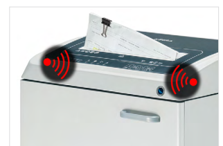
METAL DETECTION SYSTEM SHRED GUARD

The Shred Guard System stops the machine when large metal objects are accidentally inserted. An illuminated optical indicator warns the operator to remove these objects in order to protect the knives.