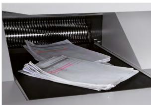
ELECTRIC CONVEYOR BELT

Convenient conveyor belt for easy feeding of material to shred.