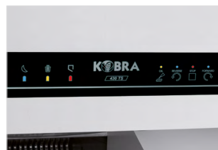
TOUCH SCREEN PANEL

Convenient conveyor belt for easy feeding of material to shred.