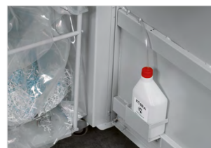
INTEGRATED AUTOMATIC OILER

Just touch the controls to activate the machine functions.